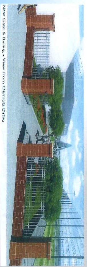
New Gate & Railing - View from Olympia Drive